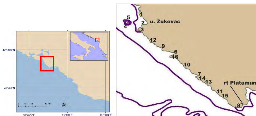
Figure 1. The explored area. 1. Cape Sipavica, 2. Žukovac inlet, 3. Cape Žukovac, 4. and 5. Seka Albaneze, 6. Nerin inlet, 7. Velika Krekavica inlet, 8. Cape Platamuni, 9. Đurđeva vala, 10. Stapac, 11. Sv. Nikola, 12. Zli potok, 13. Krekavica cave, 14. Saletova cave, 15. Sv. Nikola, 16. Cape Kostovica.

The explored area extends from the Žukovac inlet (in the north) to Cape Platamuni (in the south) (Figure 1). The investigated part is characterised by vertical and less-vertical limestone cliffs that descend steeply down to a depth of 20–30 (40) m in the sea, and therefore, the isobath of 50 m is located at a relatively short distance from the coastline. In deeper areas, the rocky bottom is sparse and more often the seabed is covered by sand.